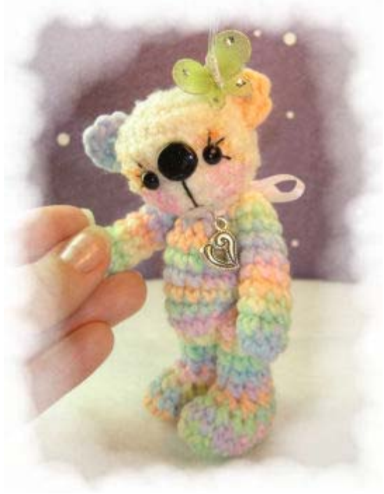
Shown here without muzzle